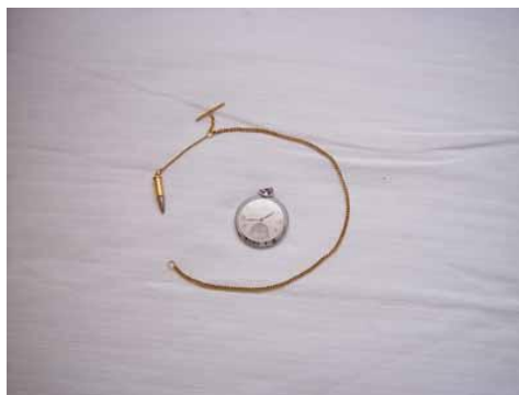
The 6.5mm bullet removed from Admiral Chan Chak's wrist with his pocket watch.

The bullet removed from Admiral Chan Chak's wrist was a 6.5mm and is presently on display in the Hong Kong Museum of Coastal Defence