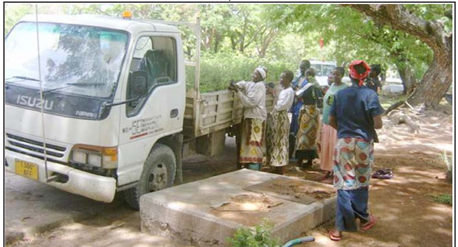
Residents of Nyasamba Village, Kishapu District, recently received tree seedlings donated by Williamson Diamonds Ltd.